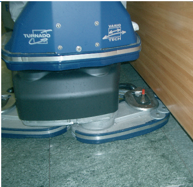
Cleaning close to edges - one of the strong features of the HEFTER Cleantech systems