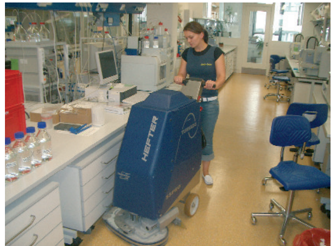
Even in areas which require great care, for instance in laboratories, the TURNADO 55 PRO makes cleaning easy to master.